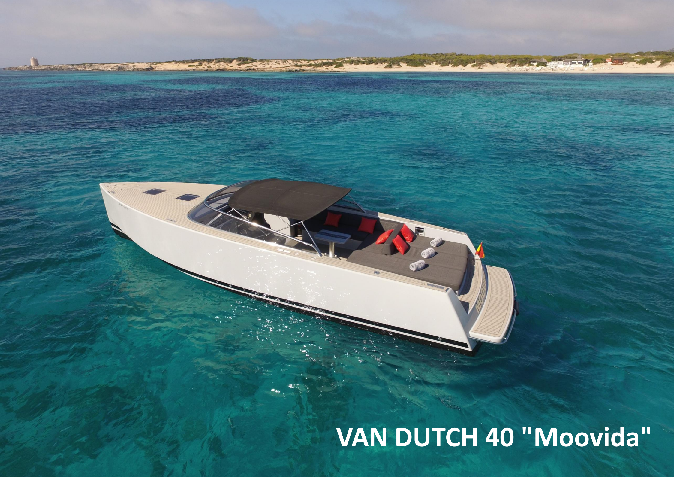
VAN DUTCH 40 "Moovida"